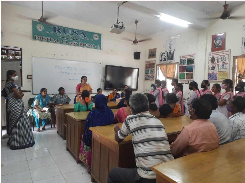
PTM for CBMB students at MB Lab