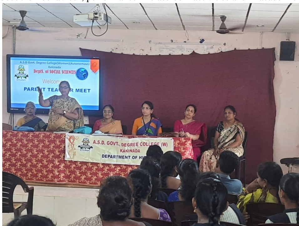
HEP PTM at Seminar Hall