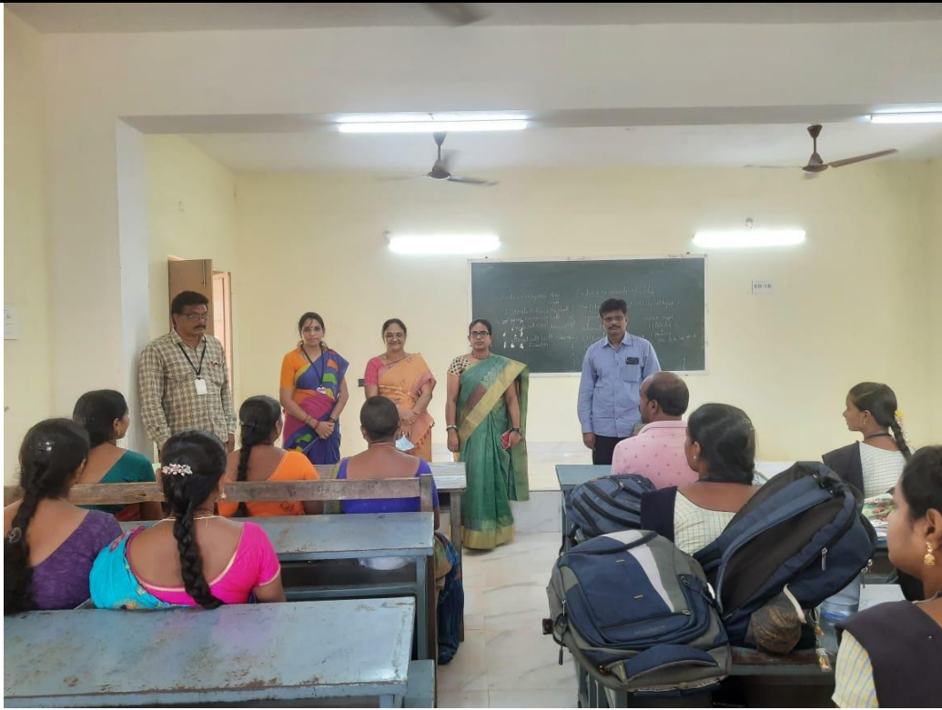
MPC PTM at RB 2