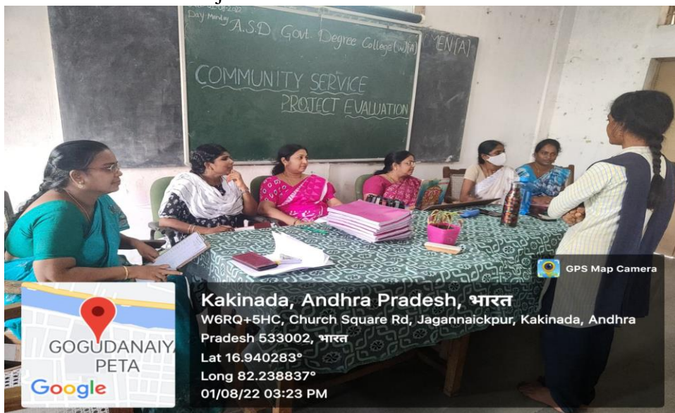
CSP Project Evaluation for II CBMB & CBZ