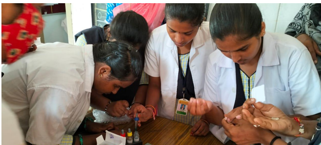
Dept. of Zoology conducted Blood Grouping as a part of Azadi Ka Amrut Mahotsav on 01/08/2022