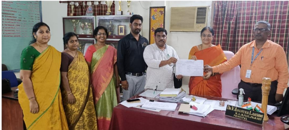
The Academic Audit 2020 report was unveiled to the College by the Expert Team.