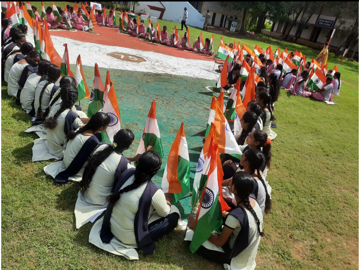
As a part of Azadi ka Amrit Mahotsav, the college students of ASD demonstrated their patriotic spirit with the symbols and gestures