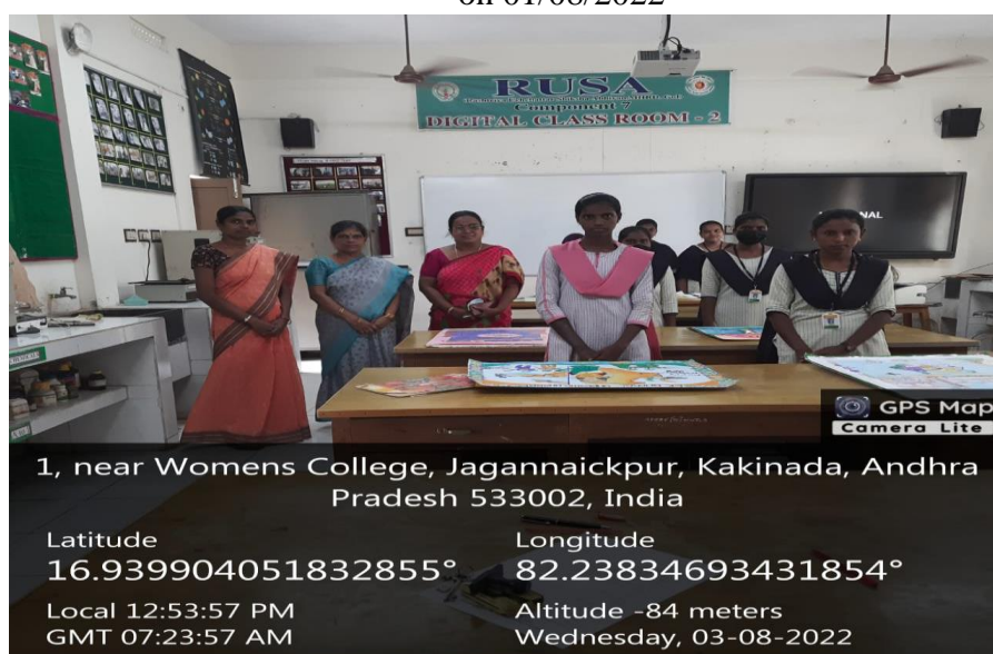
As a part of Azadi ka Amrut Mahotsav, the Department of Microbiology conducted Exhibition