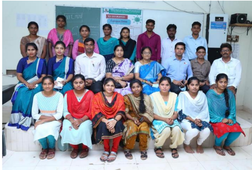
Students selected for jobs at Job Fair