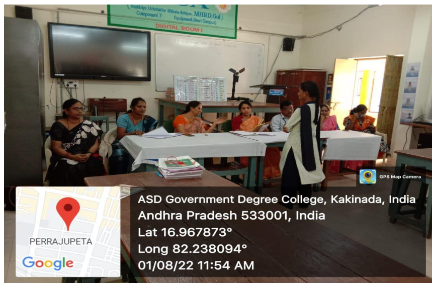
CSP Project Evaluation for II MPC & MPCS