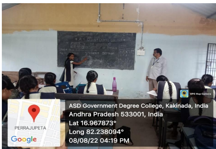
Student seminar on 08-08-2022 by II MPC & MPCPS students